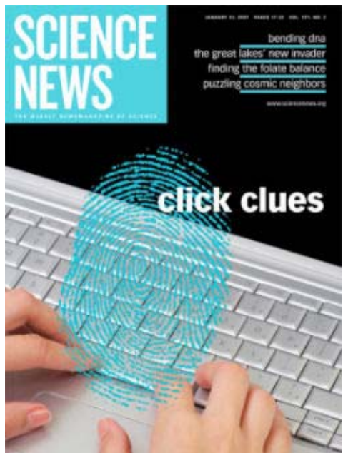
As people type messages on their computer keyboards and browse Web sites, they leave a trail of electronic fingerprints. Scientists are investigating those keystroke and mouse-use patterns to develop methods to strengthen security and reduce online fraud.

Morse code transmissions have, for the most part, been supplanted by more-elaborate forms of electronic communication, the latest being the Internet. And differences remain in the way that people tap out their electronic secrets. Internet users have characteristic patterns of how they time their keystrokes, browse Web sites, and write messages for posting on online bulletin boards. Scientists are learning to use these typeprints, clickprints, and writeprints, respectively, as digital forms of fingerprints.