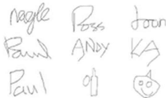
SIGNING BY MOUSE-STROKE. To strengthen passwords, researchers developed a system that requires users to move a mouse to mimic their pen-on-paper signatures or to create a doodle. McOwan

The keyboard isn't the only method of computer input. With the rise of the Internet and its click-through format, input devices such as the computer mouse are playing an increasingly important role.